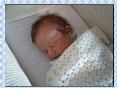
Born 26 March 2012