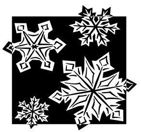
A Date for your diary! There will be a WINTER WARMER on Saturday 27 January in the village hall All funds raised will go towards a children's play area Tickets will go on sale soon!

All villagers and their friends and families welcome to join for a fun evening Sunday 5<sup>th</sup> November (next field but one to the pond) Bonfire at 6.00pm (earlier this year) Fireworks at 6.30pm BBQ (Hot Dogs & Burgers), Refreshments and Glow Sticks available for sale from 5.30pm.