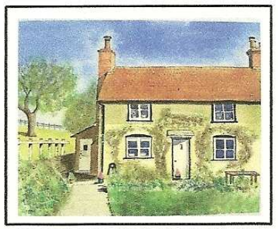
WATERCOLOUR PAINTING OF YOUR COTTAGE / HOUSE £80 or £160 (frame and mount not supplied)

FOR MORE DETAILS CONTACT John 01332 810529 or E-MAIL ebrownhill@btinternet.com